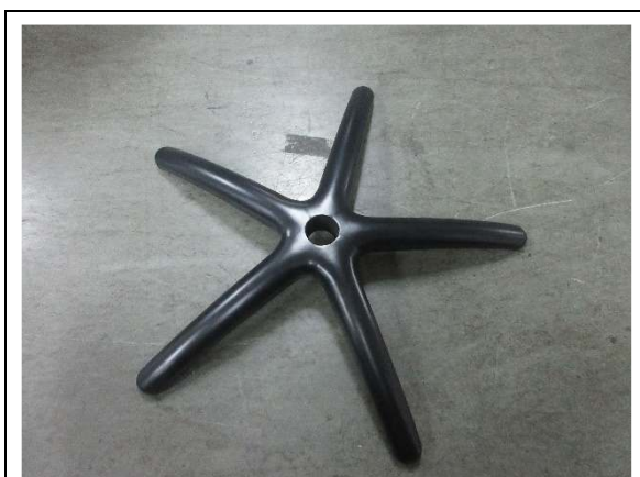
Sample as received - View 1