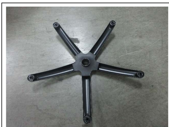
Sample as received - View 2

SGS authenticate the photo on original report only